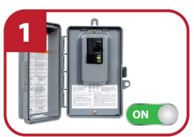
Turn power on at the main breaker.