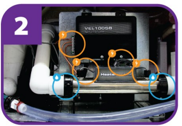
Ensure all plumbing and electrical connections are securely connected and tightened as they can come loose during transit.