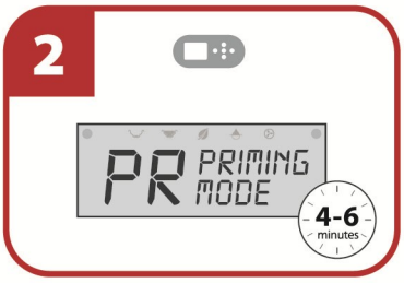
PR - Priming Mode: Your spa will now Once test is complete, you will see the run a diagnostic test. Do not press any temperature display on your hot tub buttons while test is running (4 - 6 minutes).