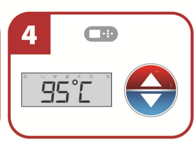
Set your hot tub temperature. Get ready to enjoy!