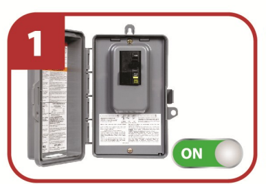
Turn power on at the main breaker.