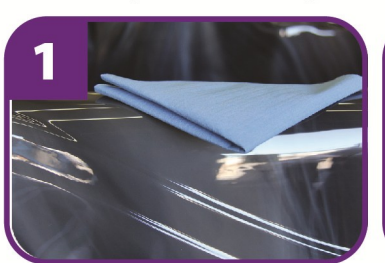
Using a cloth and water, wipe away any dirt/dust collected from transport. Ensure all jets are open by turning the face counter clockwise.