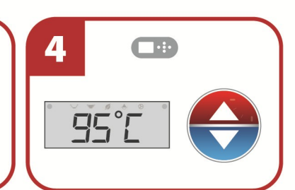
Set your hot tub temperature. Get ready to enjoy!