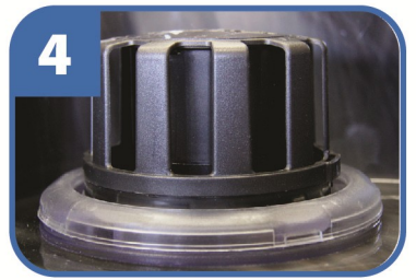
Re-install floating weir and basket assembly.