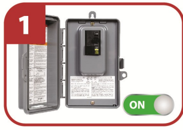
Turn power on at the main breaker.