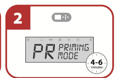
PR - Priming Mode: Your spa will now Once test is complete, you will see the run a diagnostic test. Do not press any temperature display on your hot tub buttons while test is running (4 - 6 minutes).